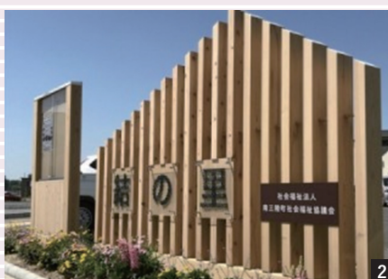
Yui no Sato (exterior view)