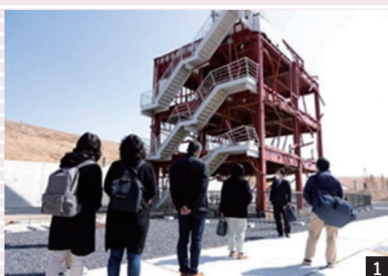
Scene of a storyteller