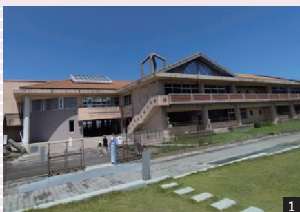
External view of the school building