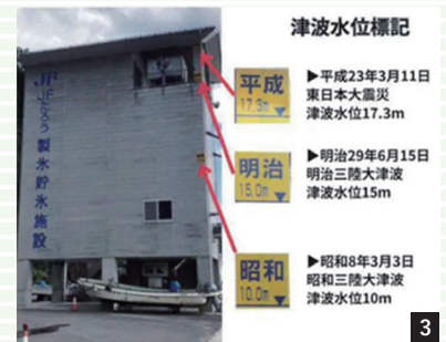
Shows the water level of past tsunamis