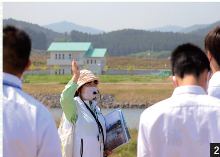
2 Scene of park guide activities