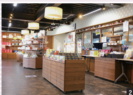
Direct sales shop