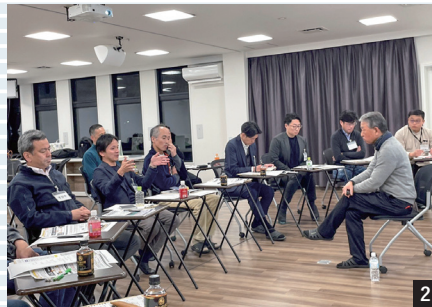
Training for working professionals to enhance their aspirations and leadership