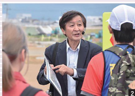
Scene of Story Teller