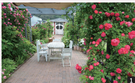
Ogatsu Rose Factory Garden