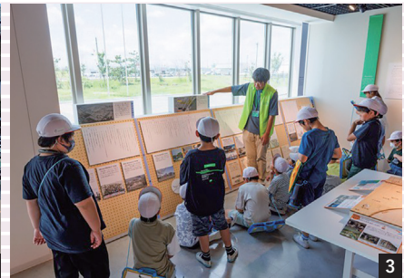
Scene of guide activities in the power plant