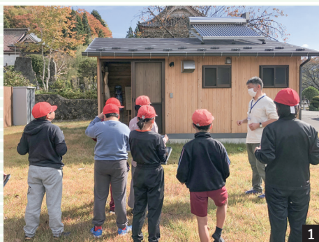
Scene of study tour support