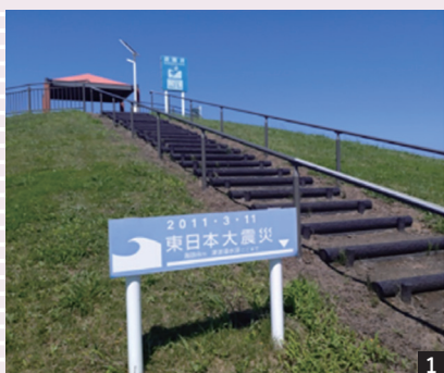
Evacuation hill in Ainokama Park