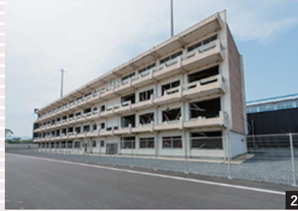
Former Kesennuma Koyo High School