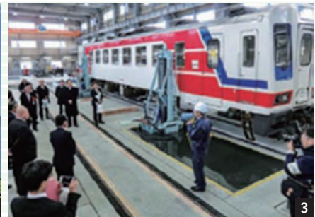
Scene of a study tour