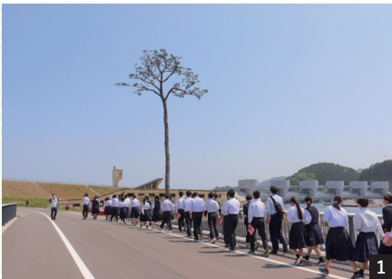
1 Park guide sharing the charm of Rikuzentakata city