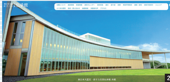
Exterior view of the facility