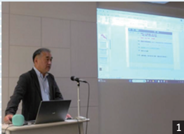
Scene of a storyteller lecture