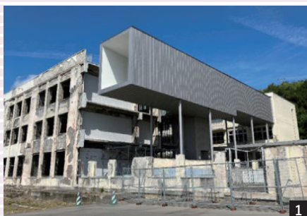
Exterior view of the elementary school ruins