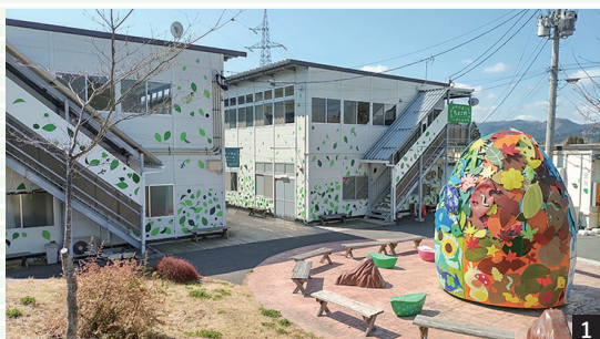
Exterior view of Tamagomura (‘Egg Village’)