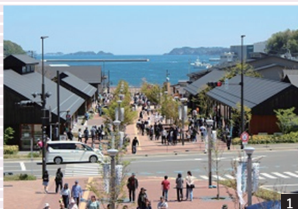
Shopping street (Seapal-Pier Onagawa)