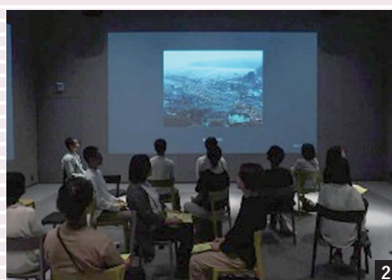
Scene of fieldwork