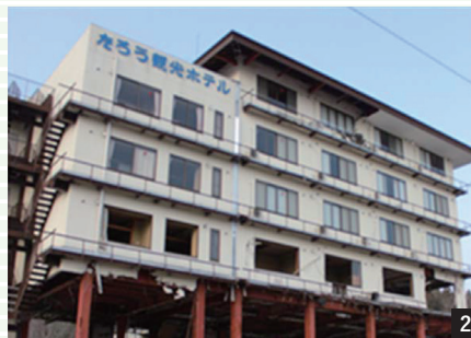
Ruins of the Great East Japan Earthquake [Taro Kanko Hotel]