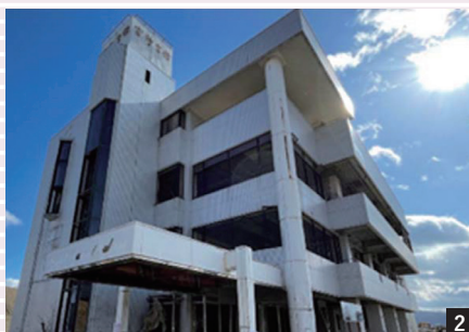
Earthquake Remains: Takano Hall