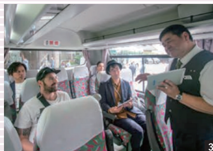
Storytellers convey information to the world