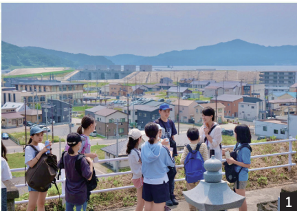
Fieldwork in Otsuchi Town