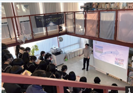
Lecture by Representative Wada