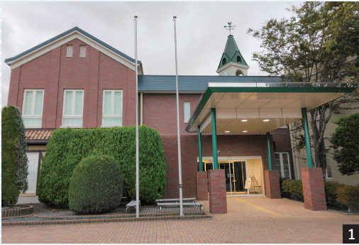
Exterior view of the facility