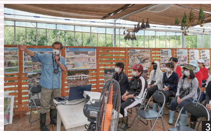
Provision of lectures in the garden