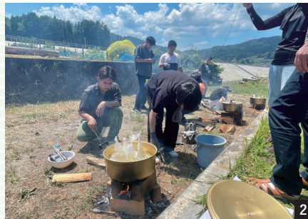
Disaster prevention food making experience