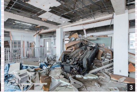
The tsunami washed cars into the school building