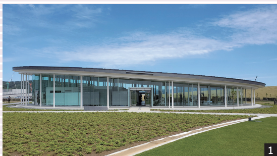
Exterior view of the Miyagi 3.11 Tsunami Disaster Memorial Museum