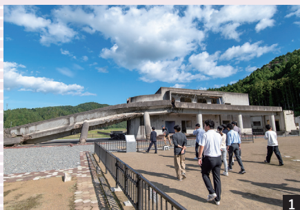
Scene of fieldwork