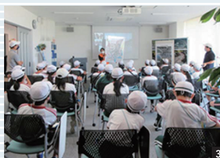
Scene of training