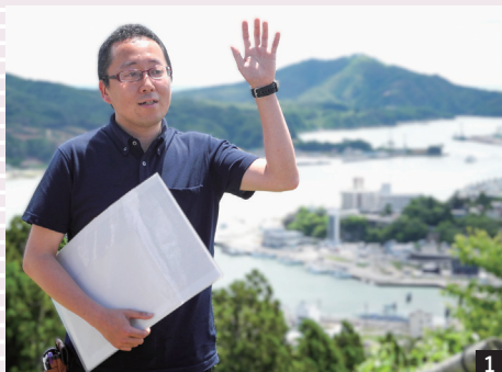
Scene of guide activities