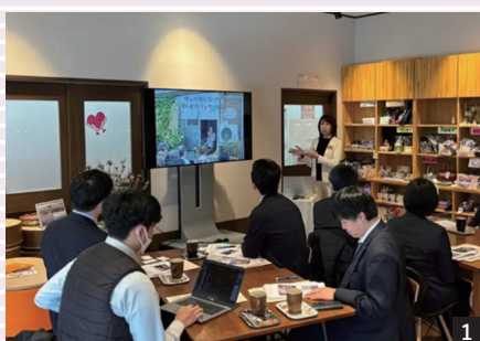
Storyteller activities at Yui no Sato