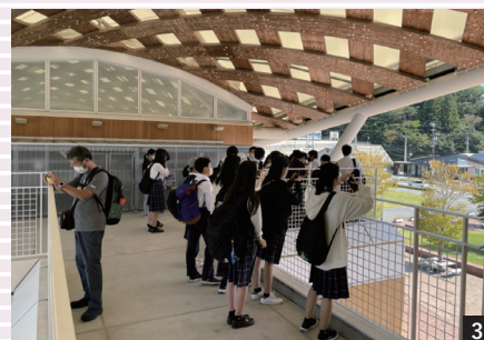
Stroll-around guide activities (Onagawa Station Observation Deck)