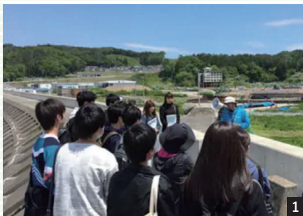
Scene of guide activities