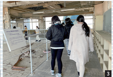
Educational trips to experience a disaster area and reflecting on oneself