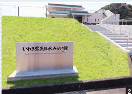
Exterior view of the Iwaki 3.11 Memorial and Revitalisation Museum