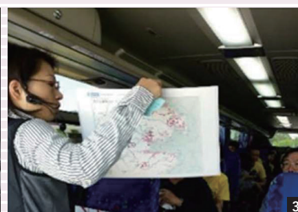
Scene of a storyteller