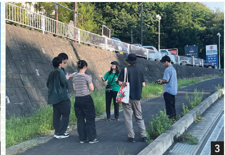
Local experience program