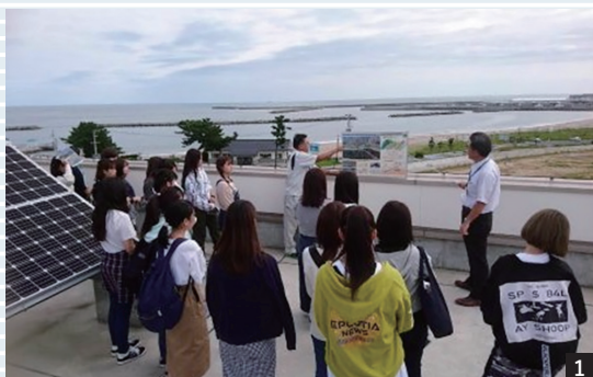
Scene of earthquake disaster/disaster prevention and inquiry-based learning