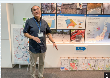
Scene of a lecture in the facility