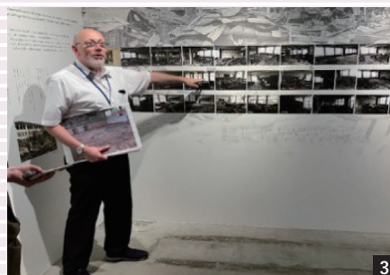
Guide activities conducted by museum director, who also serves as commentator