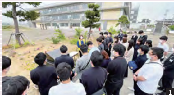
Scene of guide activities