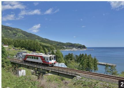
Exterior view of the earthquake disaster study train