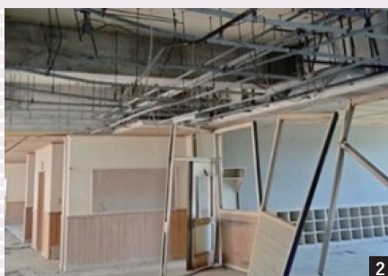
Classrooms and hallways with remains of the tsunami