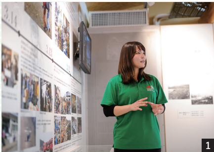
Scene of a storyteller