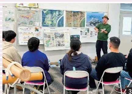
Utilizing a closed school