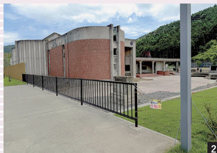
Exterior view of Okawa Elementary School