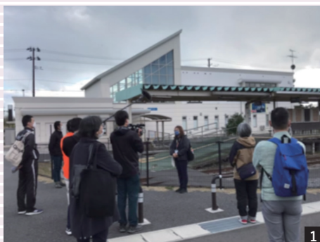
Scene of study tour support