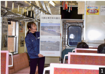
Scene of storytelling by an employee