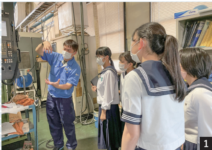
Fostering Fukushima's next generation through interaction with local role models