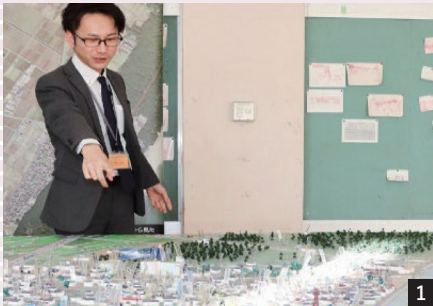
1 Scene of explanation in the school building by an employee