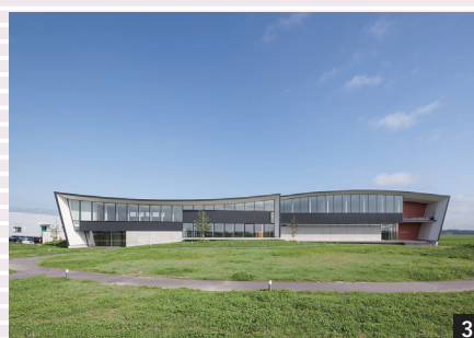
External view of the factory