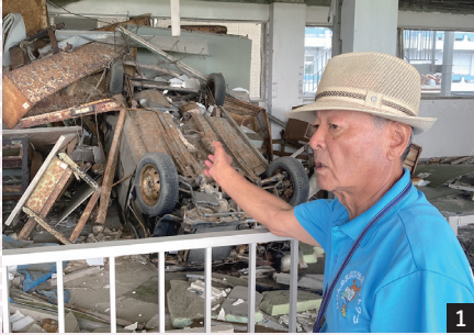
Scene of a storyteller