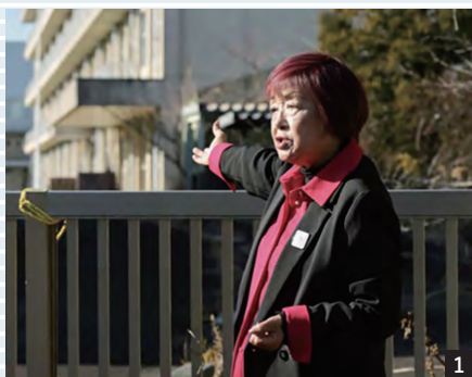
Scene of fieldwork