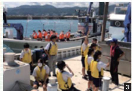
Learning from earthquake remains