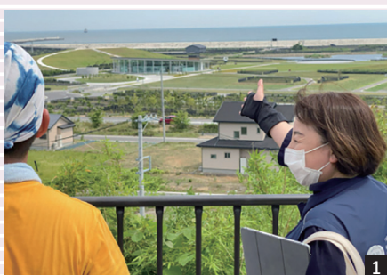
Walking with Story Tellers