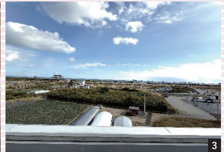
3 Arahama area and the sea seen from the rooftop