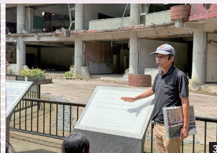
Scene of guide activities conducted by a storyteller