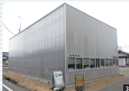
Exterior view of Odaka Pioneer Village