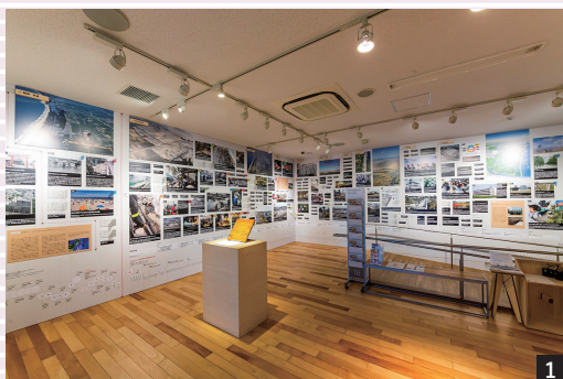
Sendai 3/11 Memorial Community Center