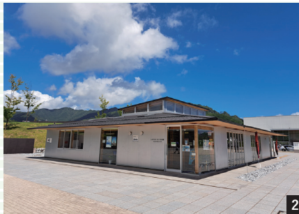
Exterior view of the facility