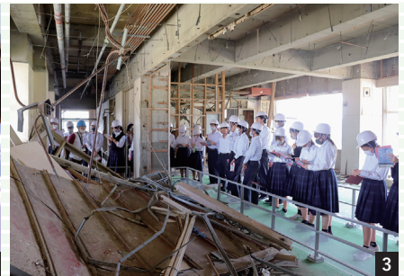
3 Scene from a tour of the interior of the earthquake remains