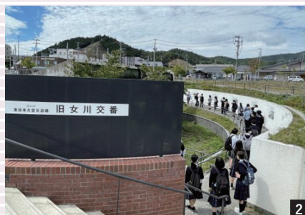
Stroll-around guide activities (Old Onagawa Police Box)