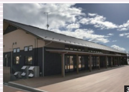
Exterior view of the facility