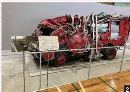
Affected vehicles on display in the gymnasium