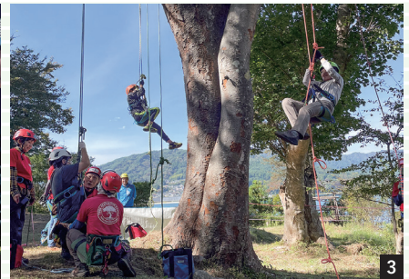
Tree climbing experience